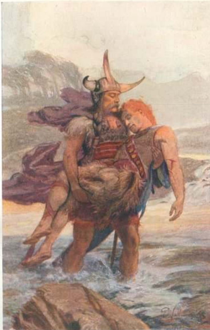
CUCHULAINN CARRIES FERDIAD ACROSS THE RIVER

Cuchulainn, Warrior of Old Irish Mythology