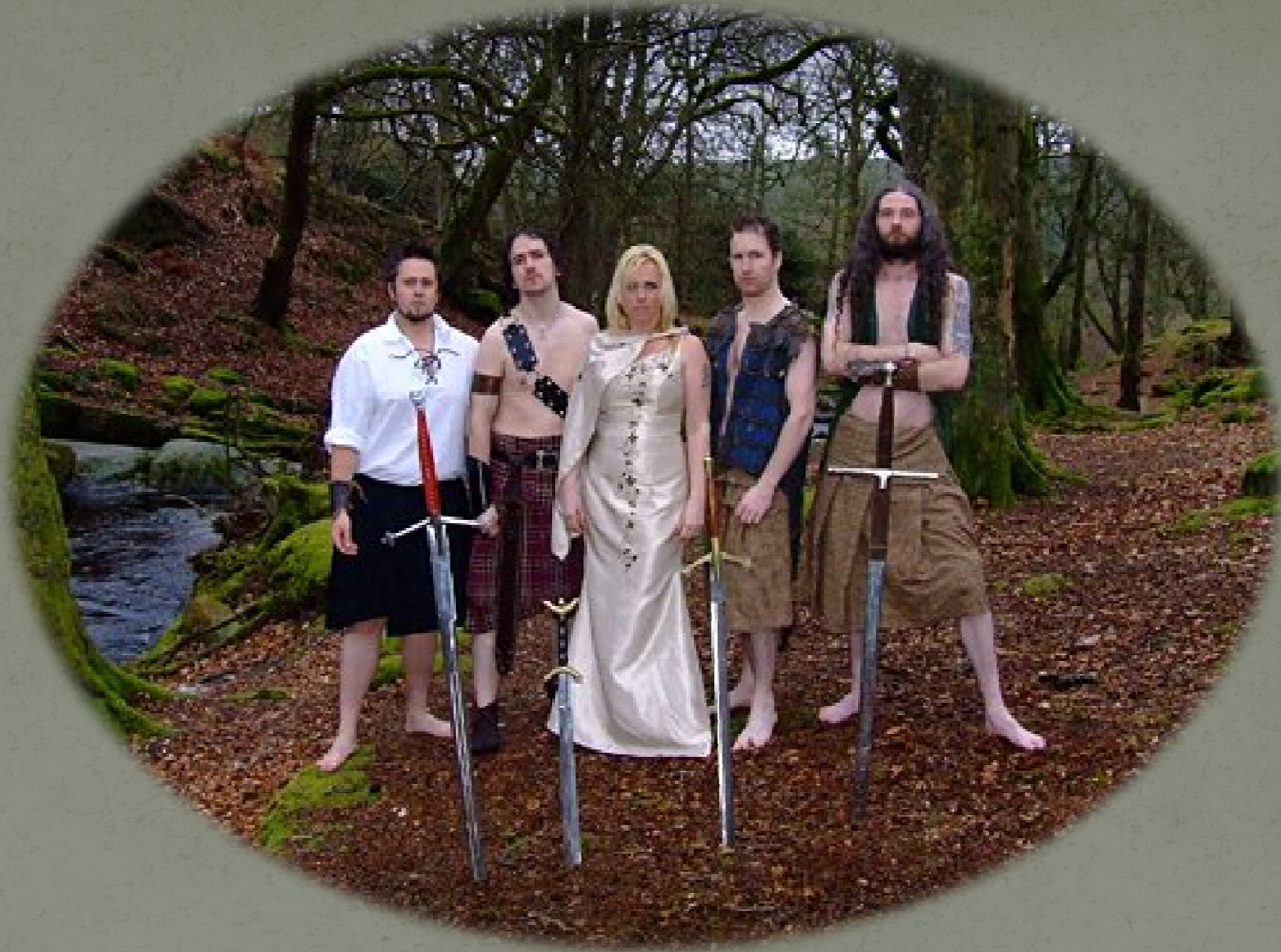
Cruatchan, a modern-day Irish band emulating ancient pagan style